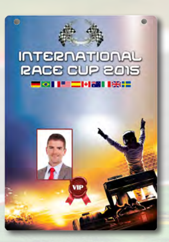
An oversized badge personalized as a VIP pass.